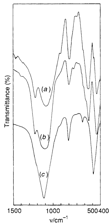
Fig. 2 IR spectra of (a) the original chromosilicate sample, (b) the sample treated with oxygen at 693 K, (c) the sample treated with oxygen at 843 K

The yellow colour of the calcined chromosilicate strongly suggests that Cr VI is bonded to extraframework O 2- ligands forming anionic species like CrO 4 2- or Cr 2 O 7 2- . It is probable that the anchored and activated Cr 2 O 3 species incorporate oxygen to form CrO 3 which is then hydrolysed during the rehydration of the zeolite. In fact, washing the sample with cold water leads to the easy and almost quantitative extraction of the chromates. The chromates were identified in the extracts by the precipitation of the reddish-brown Ag 2 CrO 4